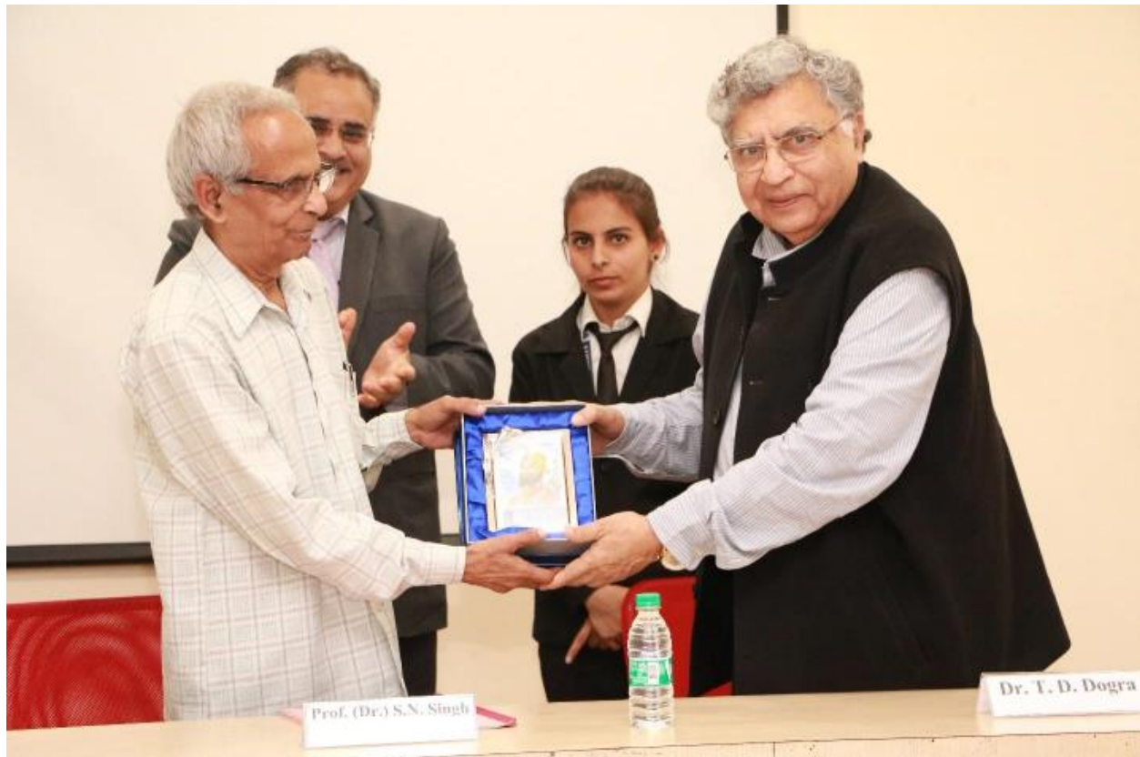
Figure:02 The quest speaker is being felicitated by the Cometent authority

Budhera, Gurugram-Badli Road, Gurugram (Haryana) – 122505 Ph. : 0124-2278183, 2278184, 2278185