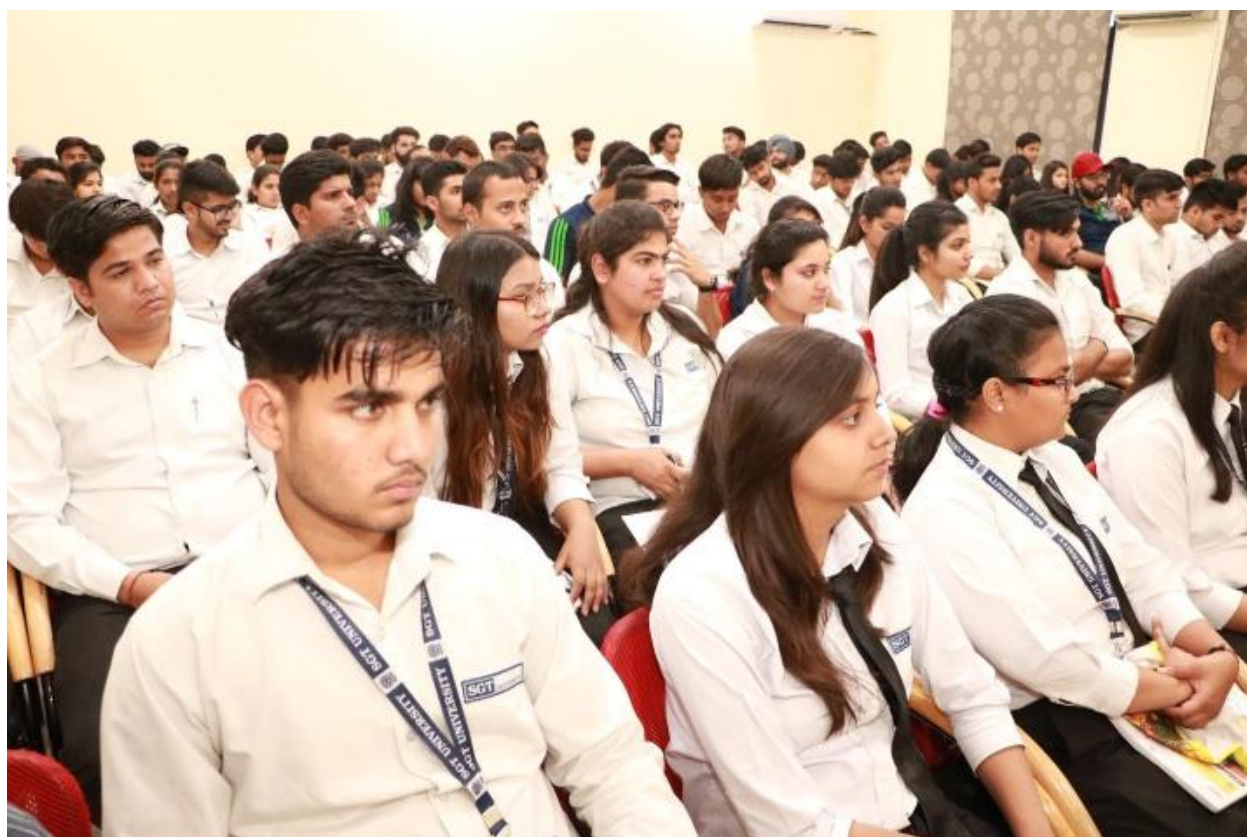
Figure:03 A section of audience

Budhera, Gurugram-Badli Road, Gurugram (Haryana) – 122505 Ph. : 0124-2278183, 2278184, 2278185